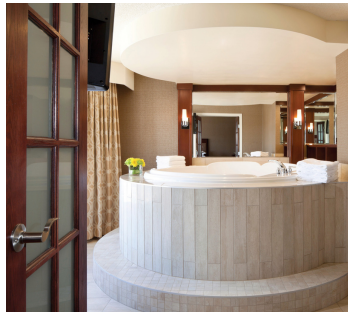
Jacuzzi suites offer views, roomy bedroom & lush living area.