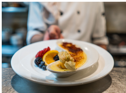
An award winning chef and excellent catering team to plan & execute your unique vision