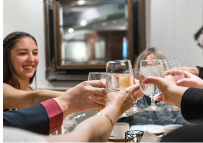
Perfect spot to host pre & post wedding gatherings