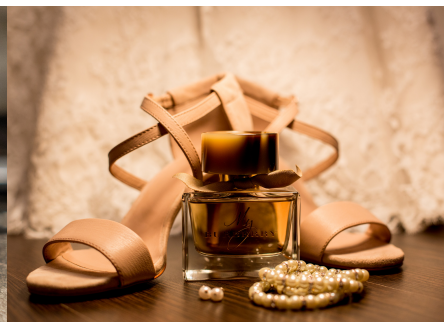
Side Street Fashion offers high-quality ladies fashion & accessories in a relaxed environment