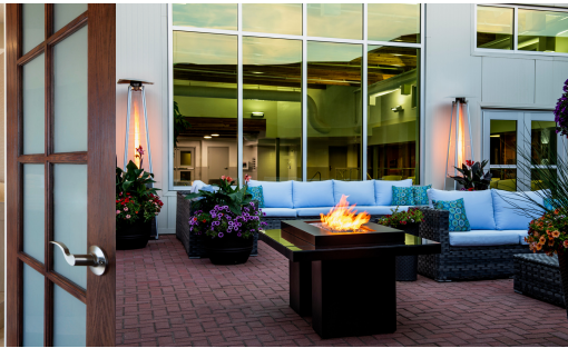
Outdoor patio can be booked for pool parties, barbecues & summer gatherings