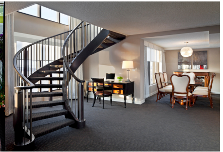
Presidential Suite includes luxurious living room, loft-style bedroom & two-person Jacuzzi tub