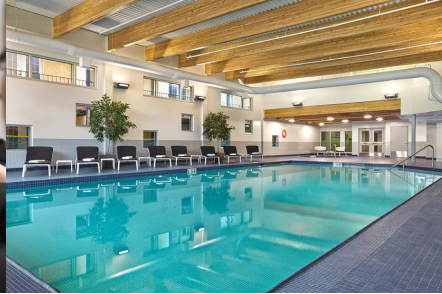
Heated indoor pool & whirlpool, Offering Poolside food & Beverages